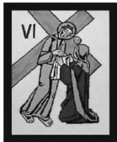
A woman, Veronica, wipes Jesus' face.

This Lent our parish is participating in the CRS Rice Bowl, a faith-in-action program that helps families experience Lenten spirituality by living in solidarity with people in need around the world. Please read the Lenten Calendar reflections each day as family and place your CRS rice Bowl in a prominent place in your home and use it to collect your Lenten sacrifices. We will be collecting CRS Rice Bowls at the end of Lent, so stay tuned to learn more. Thank you for using CRS Rice Bowl with your family this Lent.